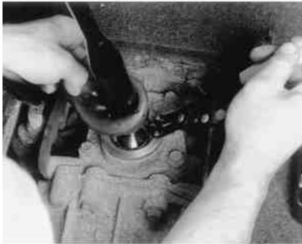
Fig. 5: Remove the shift lever from the transmission assembly