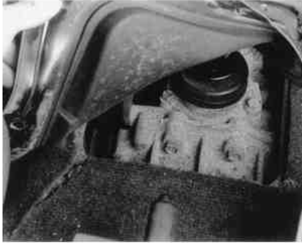
Fig. 4: Remove the circlip to remove the shift lever with a pair of snapping pliers