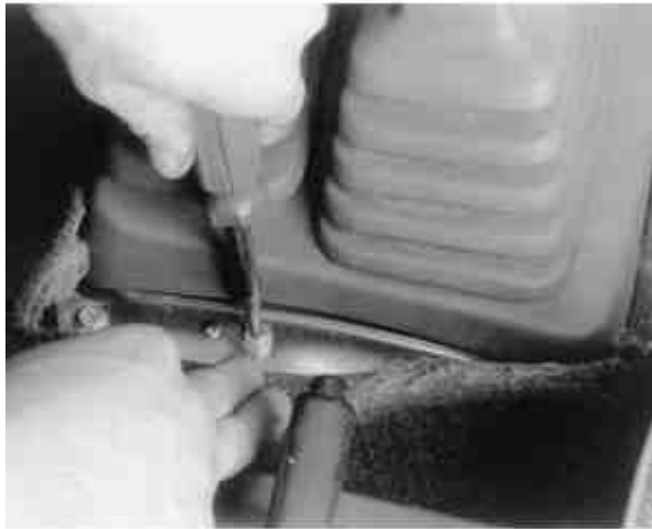
Fig. 2: After removing the screws, lift the retainer ring up