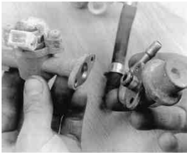
Fig. 2: Always replace the O-ring for the fuel pressure regulator

Fig. 1: The pressure regulator is easily removed from the fuel rail — note that the rail usually does not have to be removed for this